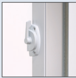
Cam Action Lock