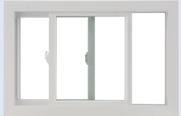
2-lite Sliding Window