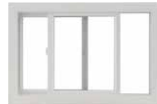
Silent Guard 2-lite Slider 34 STC rating

The glass system in the SilentGuard® Window is specially designed to provide noise abatement through the use of varying glass thicknesses. As sound waves travel through different types and thicknesses of glass, they are broken into different frequencies, thereby reducing their intensity. SilentGuard Slider Windows feature a dual-glaze 13/16-inch thick insulating glass unit, with one lite of 3/16" Low-E glass and one lite of 1/4" laminated glass.