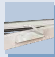
Nested Folding Handle