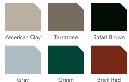
American Clay Terratone Safari Brown Gray Green Brick Red