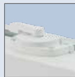
Cam Action Lock